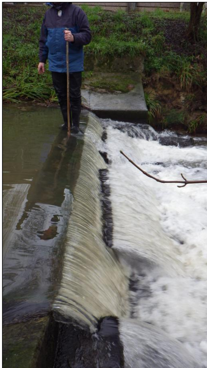
Figure 13: The weir below Hawkers Bridge

The structure now appears to be redundant and removing it or lowering a significant proportion of it to bed level could dramatically improve the habitat upstream and improve habitat connectivity, allowing more fish up into the recreational areas of the town. Removal of the impoundment could also reduce flood risk.