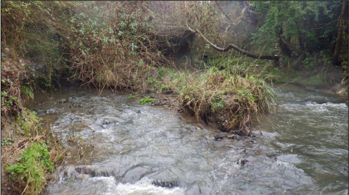
Figure 5: A depositional bar has developed in the lee of the central abutment of the double-arched bridge.

constrained by human modifications, the Cale would have been a constantly shifting and changing river and a dynamic habitat.