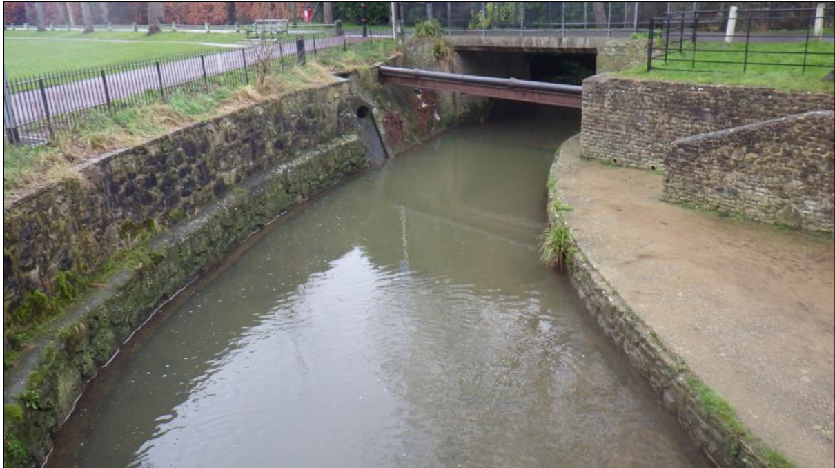
Figure 7: An area with formal access could become a key feature on the river. At present however, the location is quite industrial in appearance and may benefit from being softened with marginal plants.

public space where people of all ages can safely access the river. It is important that the river through Wincanton be appreciated as an aesthetically pleasing feature of the town if the amount of litter entering the river is to be reduced. Similar urban projects have benefitted from adopting the philosophy that the more attractive the river looks, the less likely it will be used as a rubbish dump.