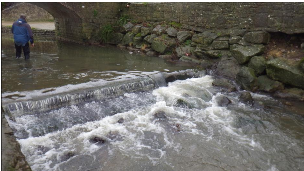
Figure 8: A small weir impounds the river but is passable for fish and acts as a pre-barrage to the sills of the bridges upstream

At Reavensbury Park on the River Wandle in London, The Wandle Trust recently replaced a similar sized weir with a retained gravel riffle which has improved fish passage and also introduced potential spawning habitat. A similar project could be a good medium term goal for this weir.