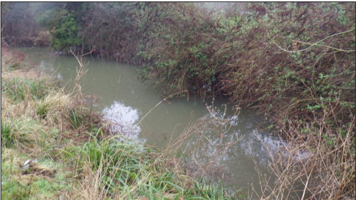
Figure 12: The habitat diversity of the meandering channel is significantly reduced as the flows are impounded by the Hawkers Bridge weir which slows flows and significantly reduces in-stream morphology

Unfortunately, habitat diversity reduces only a short distance downstream as the impounding effect of a weir below Hawkers Bridge (ST 70981 28023) artificially deepens the river. The river continues to follow a naturally meandering course but it becomes sluggish and flows become uniformly laminar.