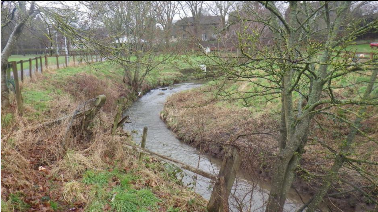
Figure 10: Habitat quality is improved as the river becomes more sinuous and faster-flowing

is scoured. This is one of the key ways in which the classic pool-riffle river sequence is formed. Pools are important holding water for fish and can be vital refuges during drought conditions. Riffles are important for gravel spawning fish and can be a refuge for smaller fish from larger aquatic predators.