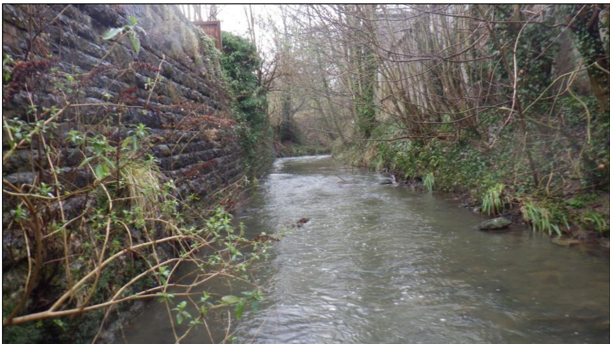
Figure 4: The straightened, canalised section of the river could be cost-effectively improved by repositioning existing bed load

Works could be undertaken by volunteers at little or no cost potentially making this site a quick-win option for kick starting a wider scheme of habitat works. However, care should be taken to ensure that enough of the habitat currently provided by the large stones for bullhead ( Cottus gobio ), is preserved so as to not harm the resident population. The bullhead is a small fish, sometimes called 'Millers Thumb' because of its unusual shape, which can spend almost its entire life under one stone. They are a protected species, enjoying high-level conservation status and present in the Cale.