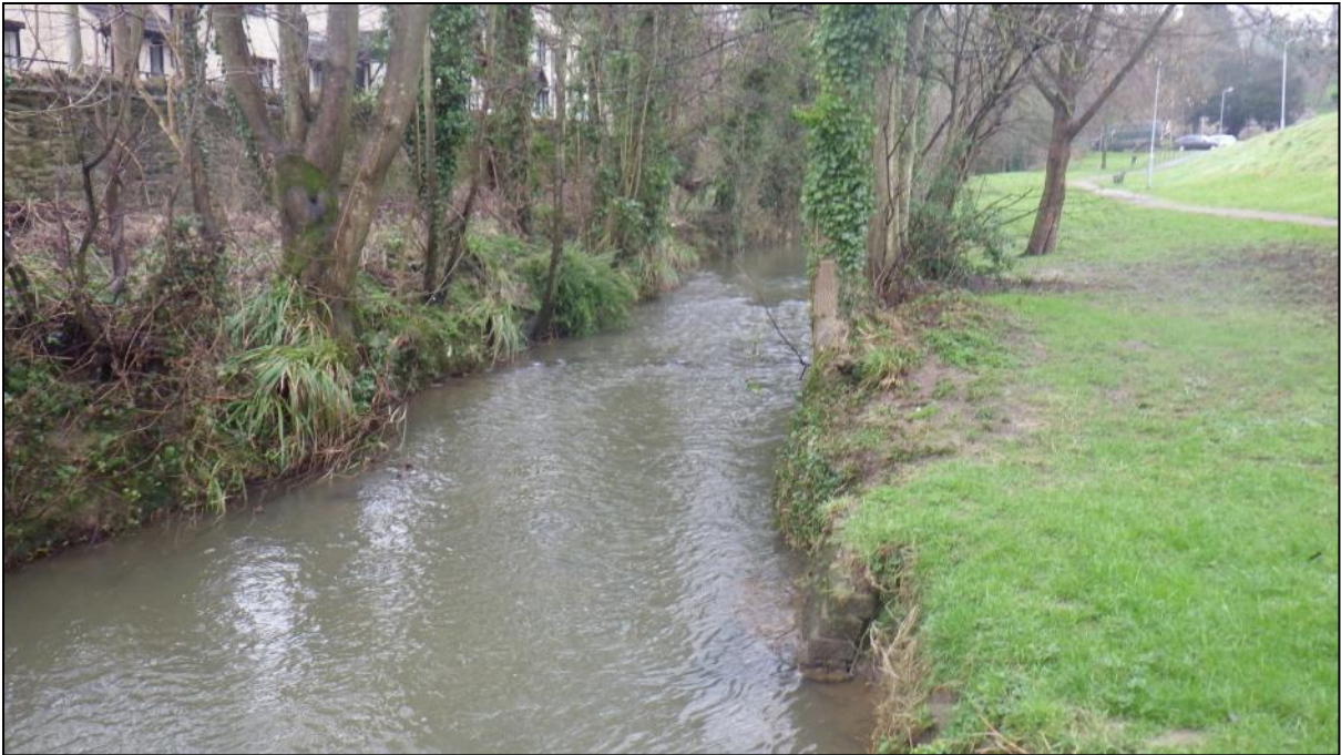
Figure 3: Some sections may be slightly over-shaded in mid-summer when bankside trees are fully in leaf.

The recreational importance of this stretch of the river may make it a good candidate for a habitat project. Tree works to punch occasional 'skylights' in the tree canopy or thin out some of the smaller trees amongst the bigger ones could benefit river plants and the wood arising from such works could be used to create some simple woody debris habitat features in the channel.