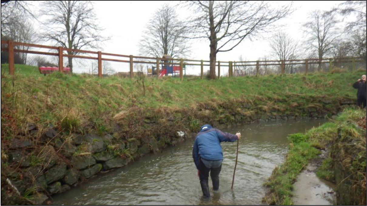
Figure 9: Although not ideal, the rocky rip-rap revetment on the left bank does provide some habitat for invertebrates and plants

As the river flows alongside the playing fields it begins to resume a more natural course and becomes noticeably more sinuous. Low-lying shrubby bankside plants provide some good overhead cover for fish and the roots of bankside trees help to introduce diversity by deflecting flows and also provide coarse woody debris which can be an important refuge for juvenile fish. Large pieces of rubble introduce further flow variation and create pockets of localised bed scour.