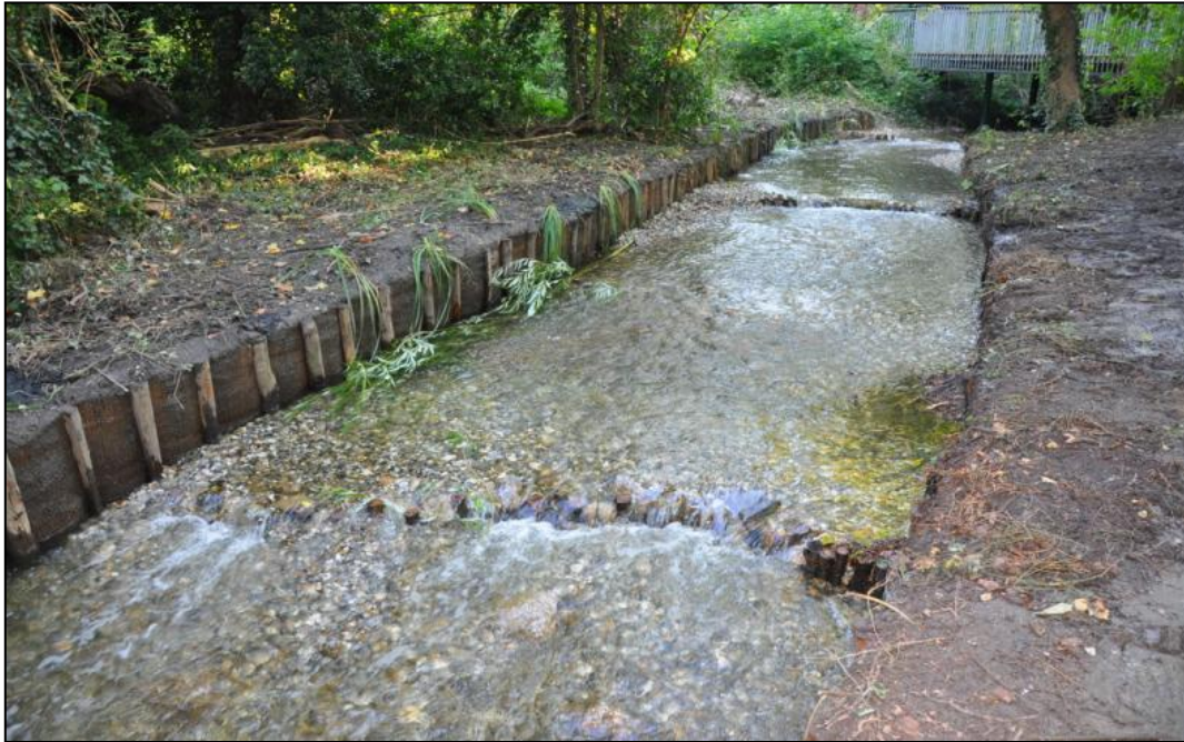
Figure 15: A long gravel installed to replace a weir in Ravensbury Park on the River Wandle.

Works to green-up this area could be made more cost effective and valuable if undertaken in combination with works to replace the nearby weir (Fig 8) with a retained gravel riffle.