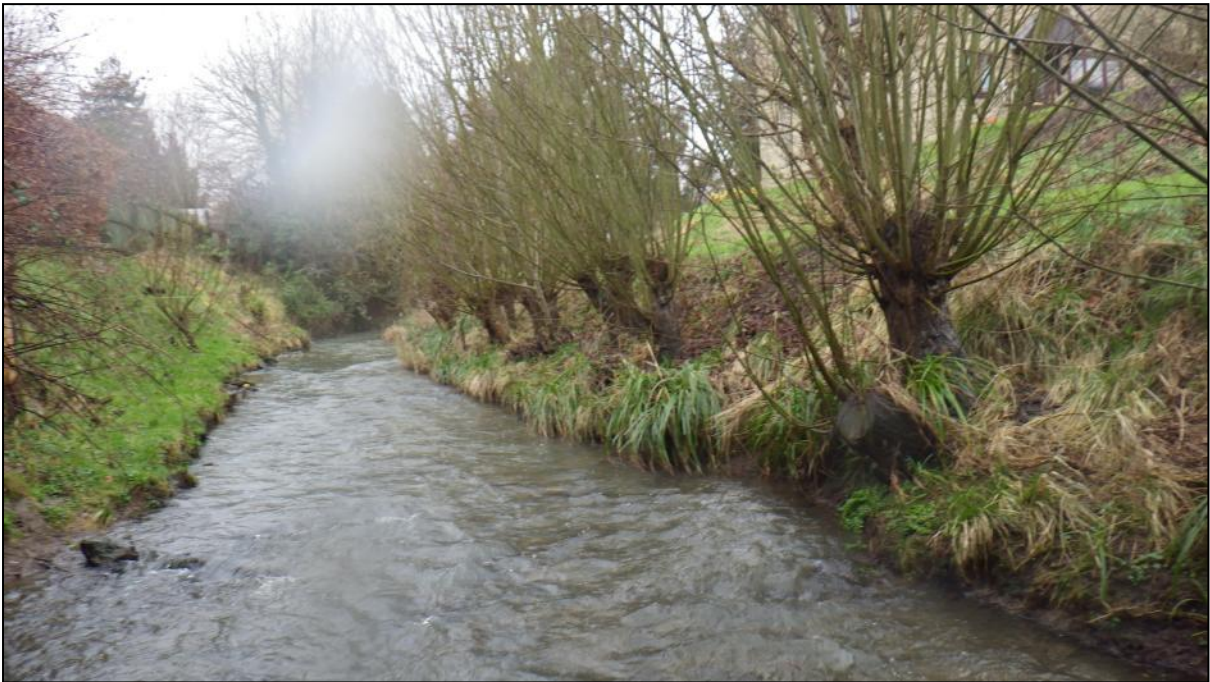
Figure 6: Live willows providing bank erosion protection.

Willow can also be used to create living woody debris habitat features. Such features can be good at withstanding heavy spates but will require annual maintenance to prevent them becoming unmanageable.