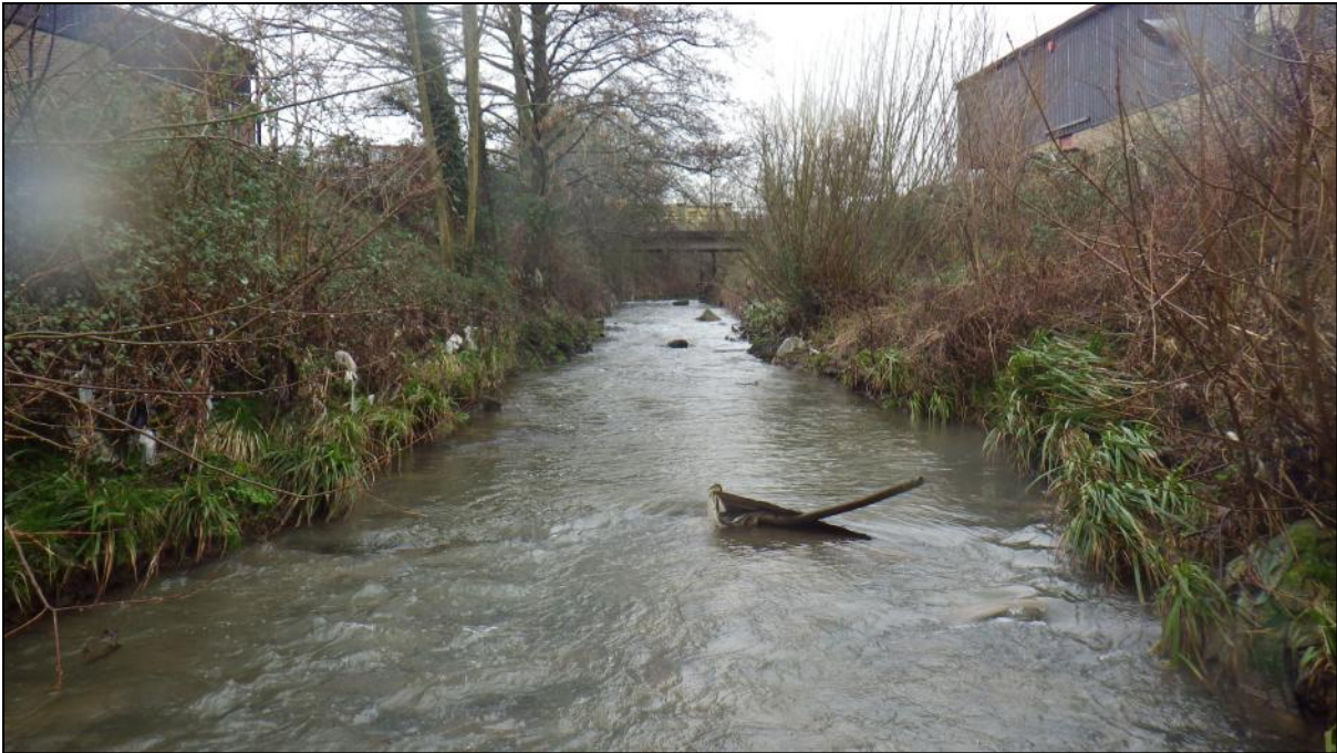
Figure 14: The river downstream of Bennets Field Industrial Estate could be cost-effectively improved by the installation of some simple flow deflectors and the repositioning of existing bed load.

Fish passage under the A303 bridge could be problematic during low flows. An Environment Agency flow gauging telemetry point under the bridge uses the regular trapezoidal shape of the channel to gauge flows. Options to improve fish passage through this section may impact on the calibration of this gauge and so any alteration of the channel under the bridge will have to be discussed with the Environment Agency.