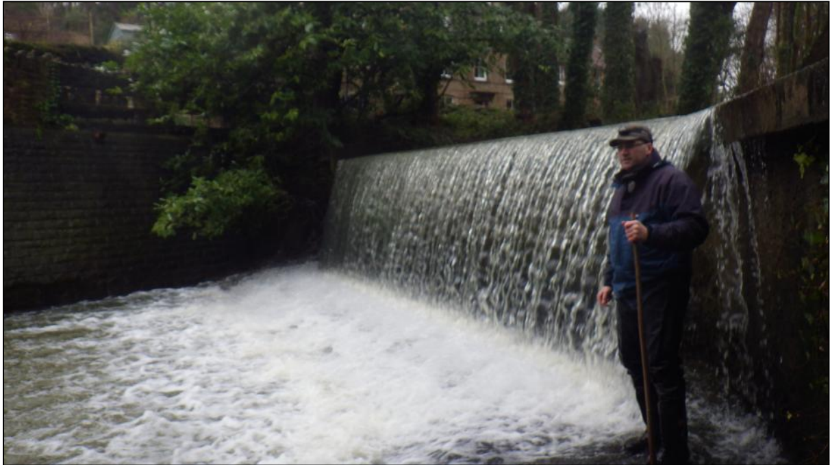
Figure 2: The 'waterfall' is a straight-drop, wide crested weir that completely fragments the river habitat and cuts the headwaters of the river off from the river downstream.

In the short-medium term, actions to improve the Cale should remain focussed on the river downstream.