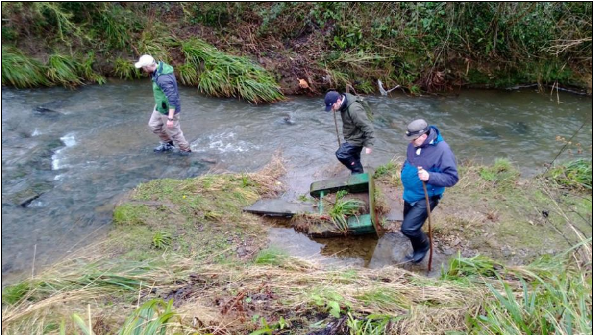
Figure 11: The fast-flowing and diverse habitat downstream of the playing fields

Unfortunately, habitat diversity reduces only a short distance downstream as the impounding effect of a weir below Hawkers Bridge (ST 70981 28023) artificially deepens the river. The river continues to follow a naturally meandering course but it becomes sluggish and flows become uniformly laminar.